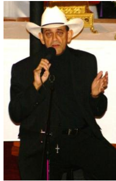
At the shrine of Our Lady of America Rome City, IN