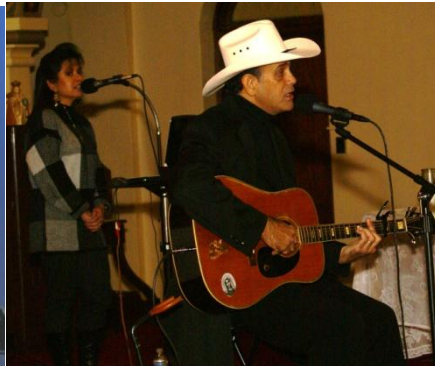
In Rome City Indiana at the National Shrine of Our Lady of America