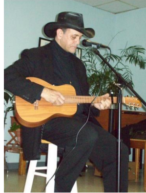
Performance in Washington DC for the Sisters of Charity