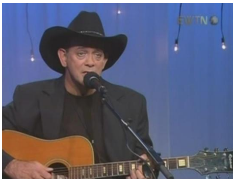
Singing "Mary Said Yes" on EWTN's Dana & Friends show