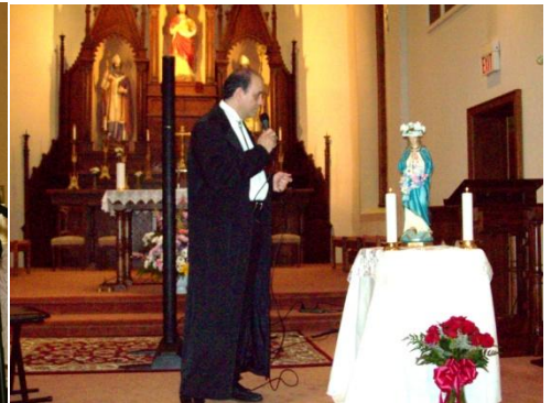
Performance at the Sacred Heart Parish in Lawrenceburg TN