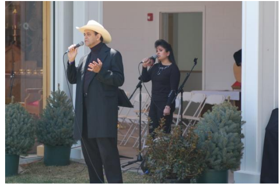
Singing "Mary Said Yes" on the world wide EWTN broadcast of the Divine Mercy Sunday Mass, Stockbridge, MA on April 19, 2009 for the Marians of the Immaculate Conception.