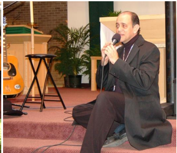
During the performance at the 25 th Annual Marian Congress in West St. Paul, MN.