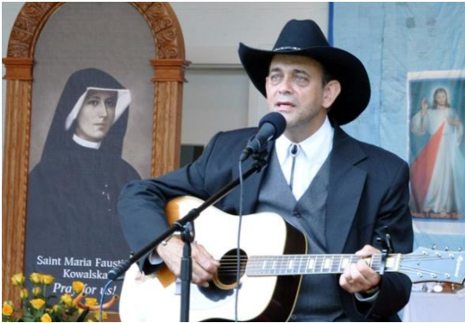
Performing THE SHOW at the 50 th Anniversary of the Divine Mercy Shrine of the Marians of the Immaculate Conception in Stockbridge, MA May 29, 2010

One Of The Most Inspirational, Spiritually Moving Performances To Ever Tour Catholic Parishes