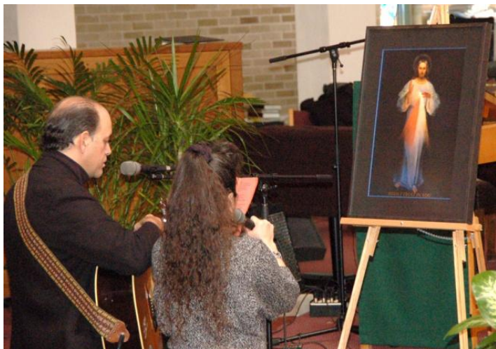
Leading the Divine Mercy Chaplet at the World Apostolate of Fatima Marian Congress in West St. Paul, MN