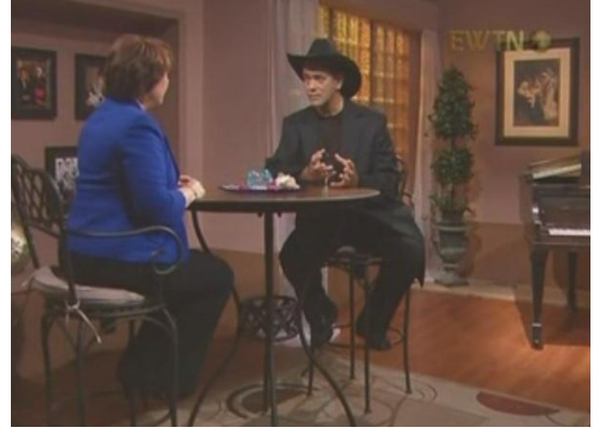
Appearing on EWTN's Dana & Friends show