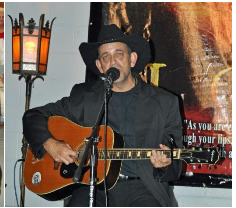
Our Sorrowful Mothers Ministry show in Vandalia, IL